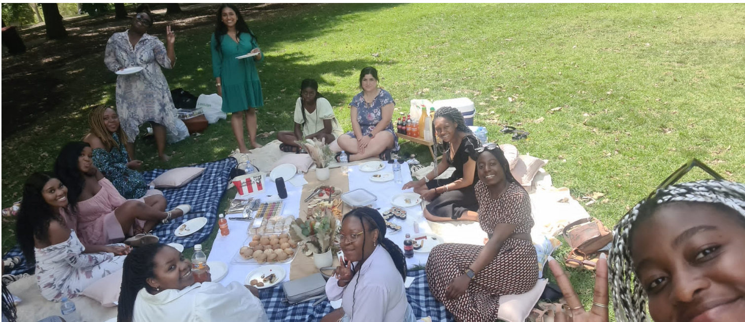
2023 Women's day picnic