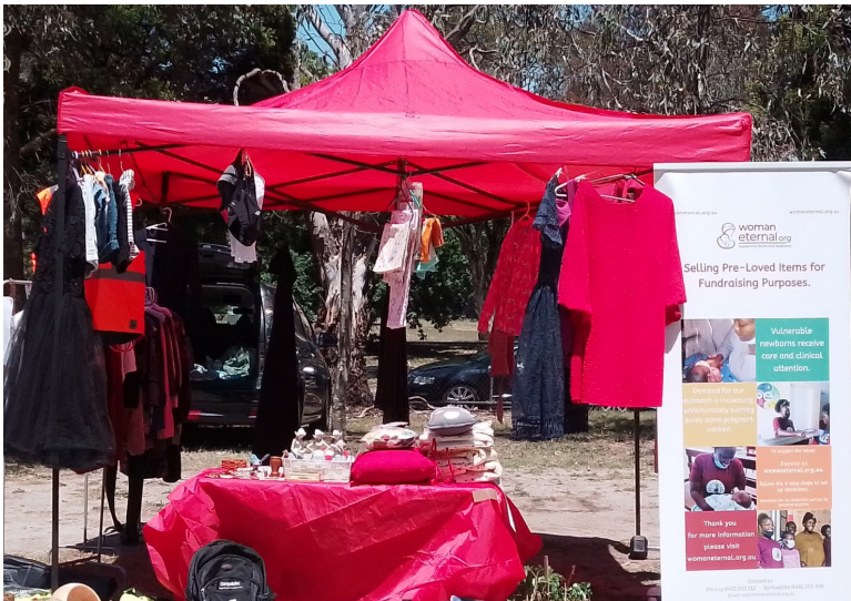
WE market stall at Mcleod Saturday market