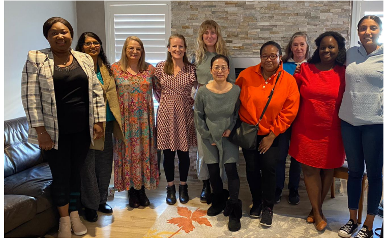
2023 Mother's Day morning tea