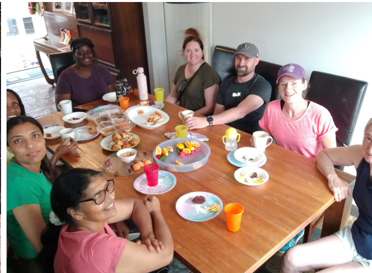
WE -walk morning tea 2023